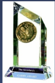
VA Cary Organizational Excellence Trophy Award 2004